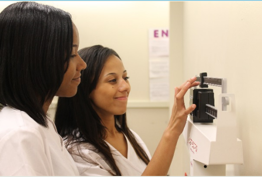
LCS CNA Program