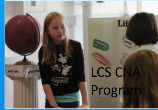
LCS CNA Program