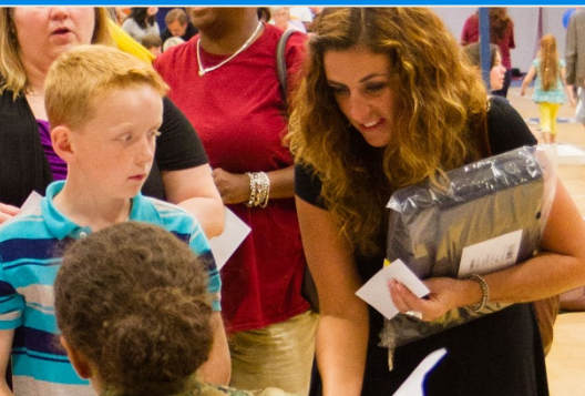
9 th Grade Chromebook Distribution